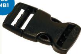
1" MCDONALD CLIP