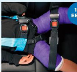
EXTREMITY BELT FOR 503 LAYDOWN VEST XS/S