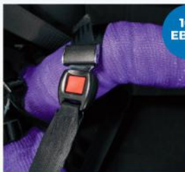
EXTREMITY BELT FOR 503 LAYDOWN VEST M