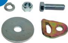
SINGLE TETHER HARDWARE KIT