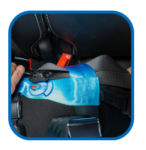
9. For passengers over 30" tall, route the middle seat belt thought the hip strap of vest, buckle and tighten.

When using a lap/shoulder belt, the shoulder portion of the belt must be in the locked position.