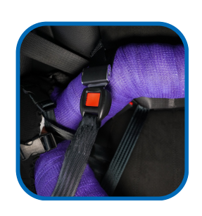
12. Place extremity belt around both legs and lap portion of the already buckled seatbelt.