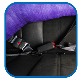
Secure seat belts as tightly as possible. Make sure all the seat belts are in the locked position.