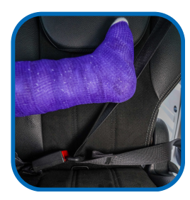
11. Buckle remaining seat belt closest to passenger's knee preparing for next step.