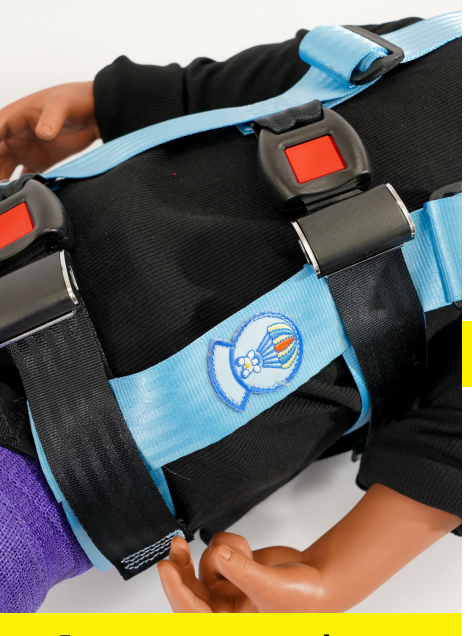
For passengers over 1 year of age and 22-106 lbs