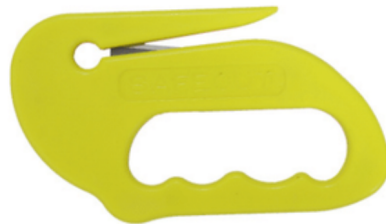
100 SCBC EZ-ON Safe Cut Belt Cutter