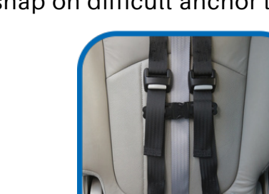
3. Tighten by pulling on black webbing so Y-bridge sits on seat top.

Twenty degrees from "Y center is acceptable.