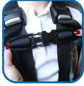
10. Clip chest clip, and position at armpit level.