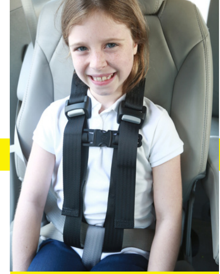
ONE SIZE 31-106 LBS